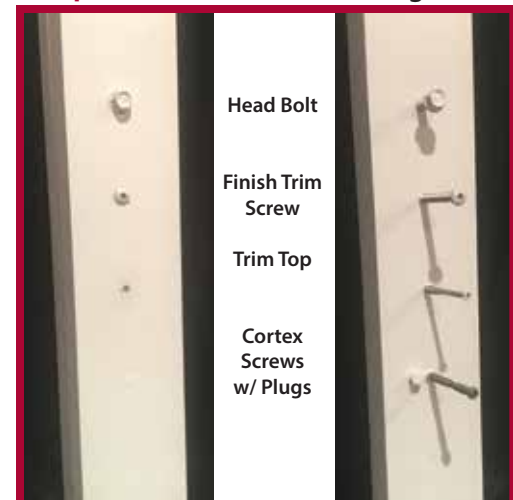
Cortex screws, torque head driver tip required