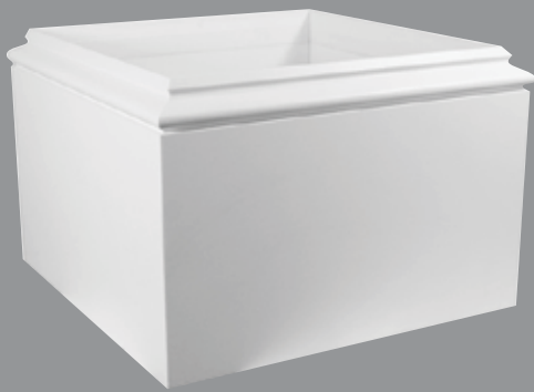
2: BASE CAP