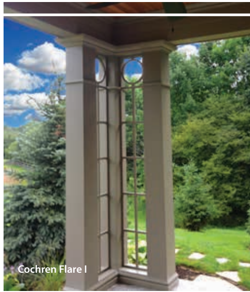
Cochren Flare I