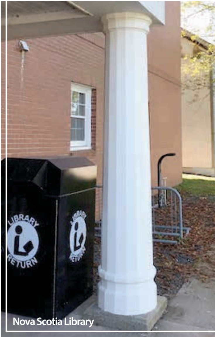
Nova Scotia Library